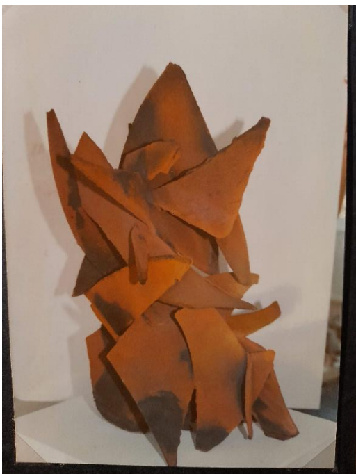
Raku fired clay sculptures