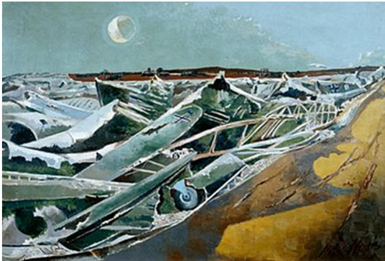
Paul Nash 'Totes Meer'