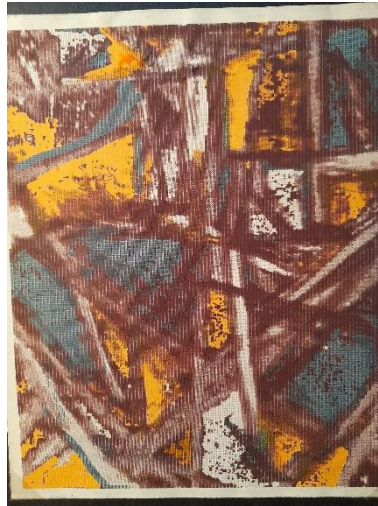
2 prints using printing ink, then scanned and manipulated on computer