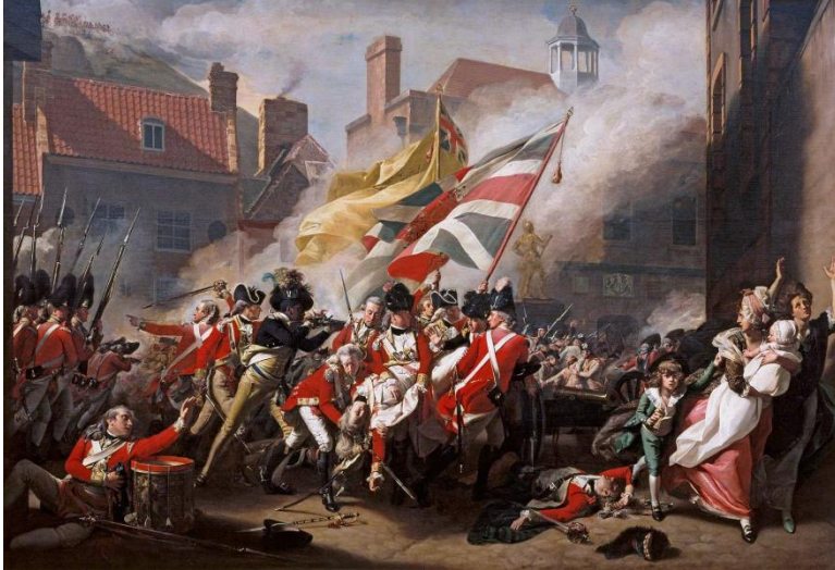
John Singleton Copley

As discussed on Tuesday, take inspiration from the three examples we looked at to show the different ways in which artists have represented 'Conflict'.